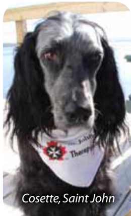
Cosette, Saint John